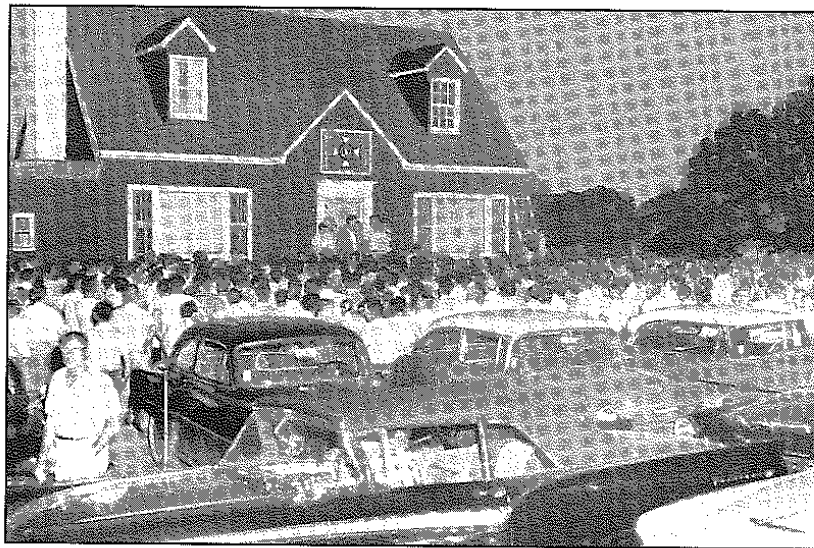
Turned into a mob by night.