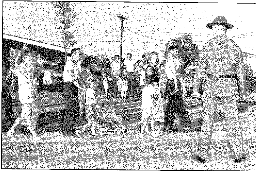
Protests during the day . . .

Appendix B: Crowds Gathering around the Myers House, August 1957 in The First Stone: A Memoir of the Racial Integration of Levittown, Pennsylvania (Chicago: Grounds for Growth press, 2004), 25.